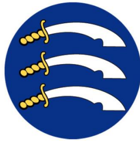
17. Middlesex CCC