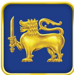
10. Sri Lanka