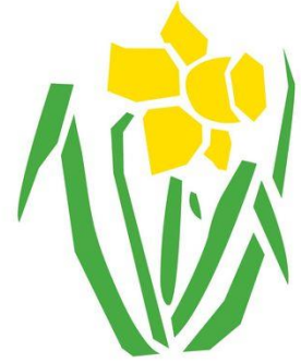
18. Glamorgan CCC