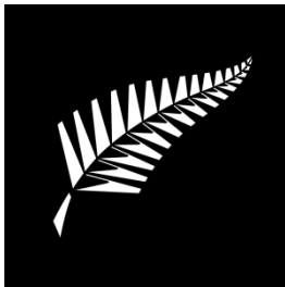
4. New Zealand