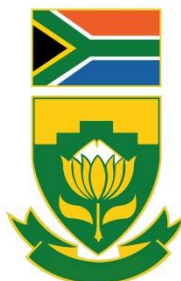
11. South Africa